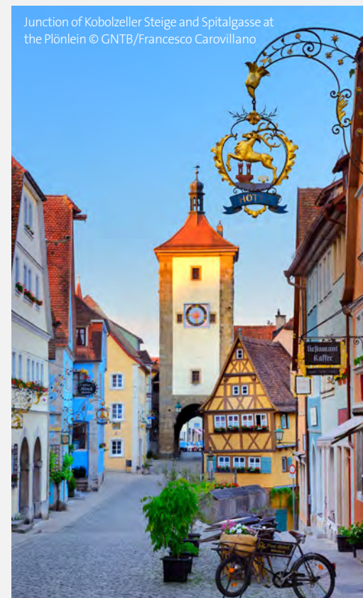
Junction of Kobolzeller Steige and Spitalgasse at the Plönlein

www.christmasmuseum.com www.kaethe-wohlfahrt.com tourguide@wohlfahrt.com