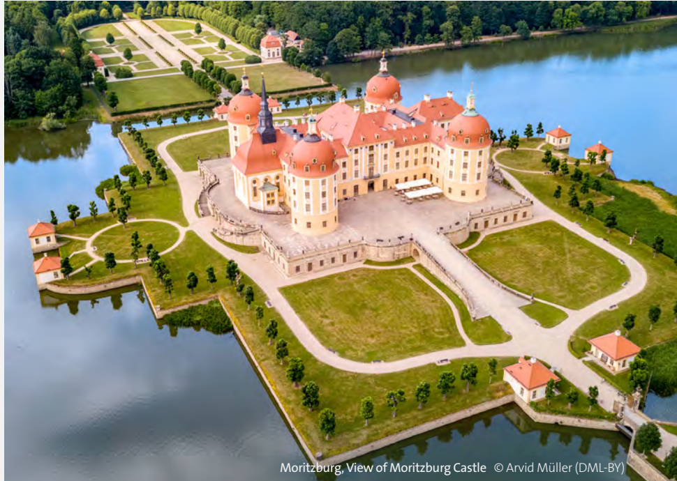
Moritzburg, View of Moritzburg Castle

In the afternoon, guests board a historic paddle steamer taking them to Pillnitz Palace, the former royal summer residence, with its beautiful gardens. Nearby, music lovers will find the idyllic summer houses of Carl Maria von Weber and Richard Wagner. Many more cultural experiences are available throughout the year.