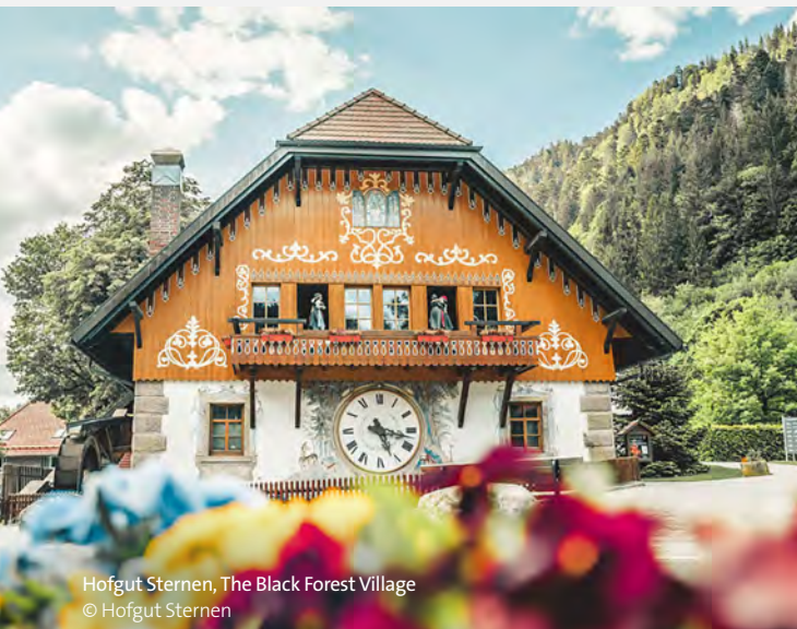
Hofgut Sternen, The Black Forest Village

Known for its idyllic and picturesque Black Forest landscape, the four-star Hofgut Sternen resort and surrounding attractions lie within the municipality of Breitnau as part of the Southern Black Forest Nature Park, the largest such reserve in Germany. The residents here live in peaceful coexistence with nature, producing their own energy and working with local farmers to help preserve the area's unique countryside scenery and rich variety of animal and plant life. Similarly, there is a prevailing preference for sustainable tourism, and travelers are encouraged to experience the natural bounty of a land noted for traditional and fine German cuisine.