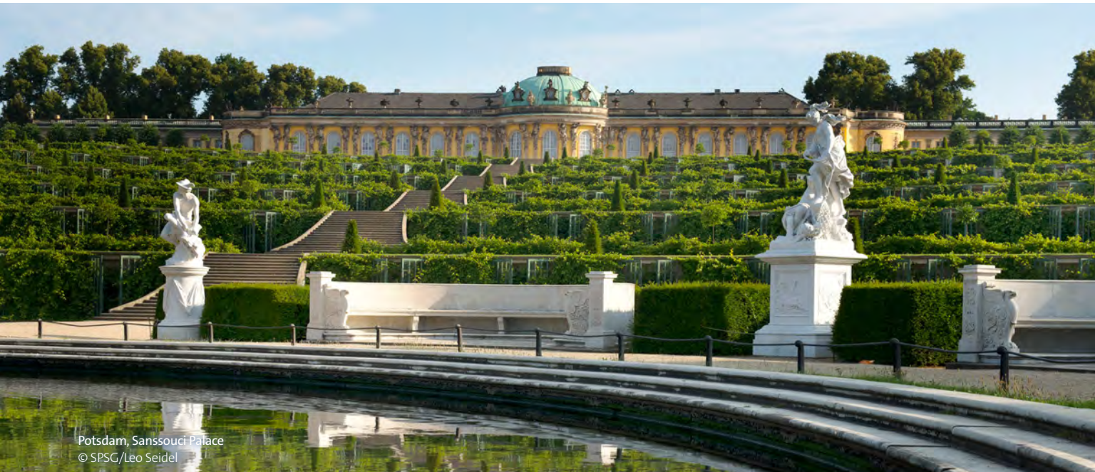
Potsdam, Sanssouci Palace