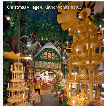
Christmas Village