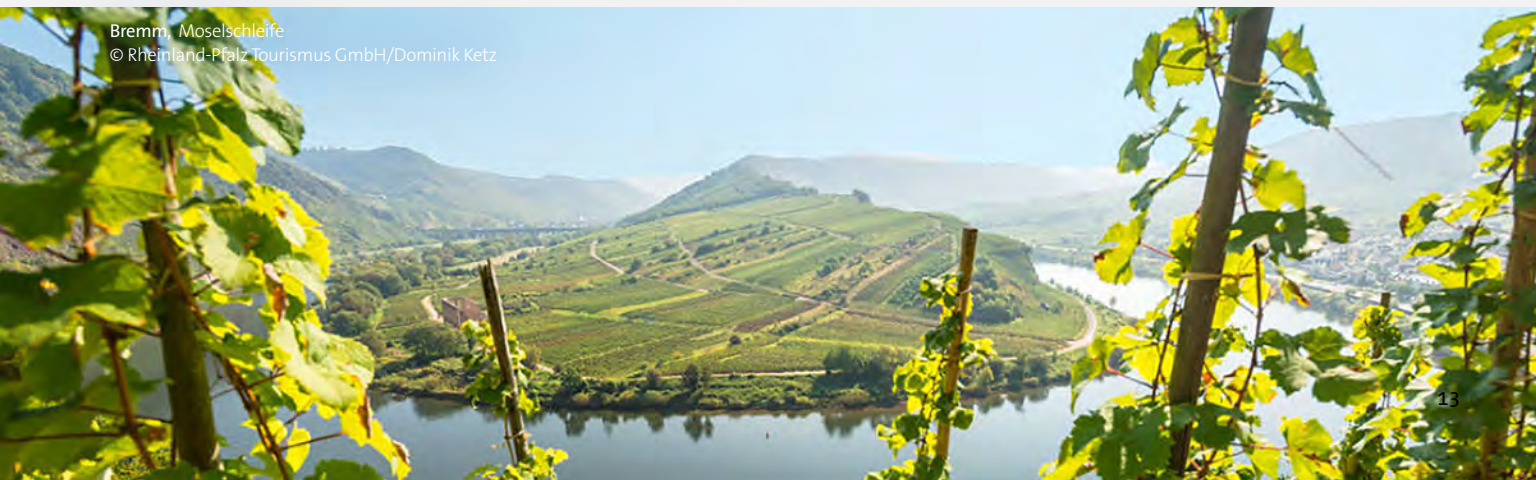
Bremm, Moselschleife