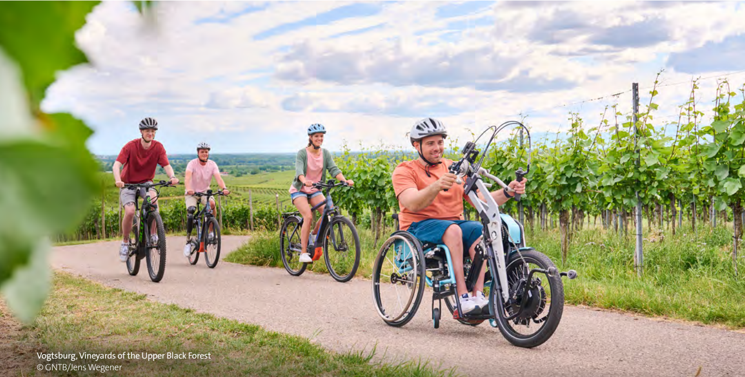
Vogtsburg, Vineyards of the Upper Black Forest

History and fables, art and science, natural wonders and wonderful cities – Germany's multifaceted makeup offers a wide range of adventures for all those who love to travel. Over the past few years, a number of projects have made the country's many attractions more