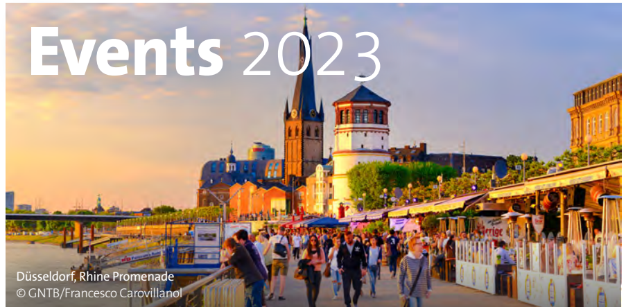
Düsseldorf, Rhine Promenade