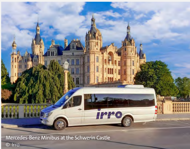
Mercedes-Benz Minibus at the Schwerin Castle

For more than 50 years, Irro Charter's mission has been to take travel groups to the best places in Germany in a timely, comfortable way. Family run, the company provides both coach transport and modern mobility services. Every day, more than 190 Irro team members draw from a fleet of 140 vehicles, exerting award-winning effort to ensure clients can enjoy a pleasant trip and reach their destination relaxed and set for explorations.