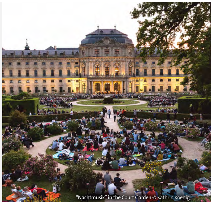
"Nachtmusik" in the Court Garden

With award-winning museums, Michelin-starred restaurants and high-class music events, Würzburg is a destination of choice for art lovers and foodies alike.