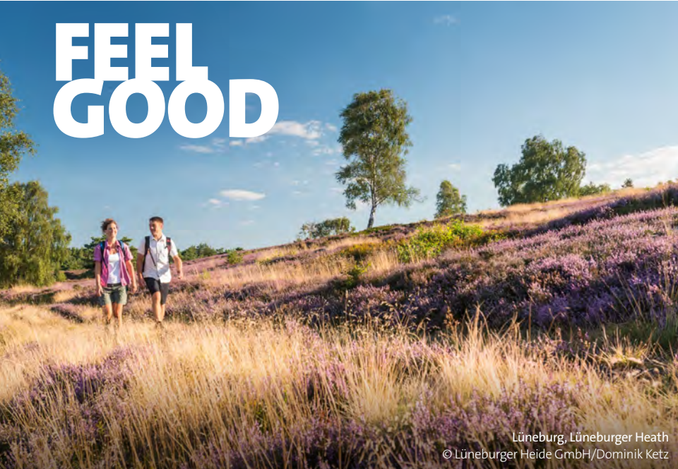
Lüneburg, Lüneburger Heath

Well-kept natural landscapes, regional and fresh cuisine, responsible hosts: These are the hallmarks of sustainable tourism, and all form an important part of the German travel experience.