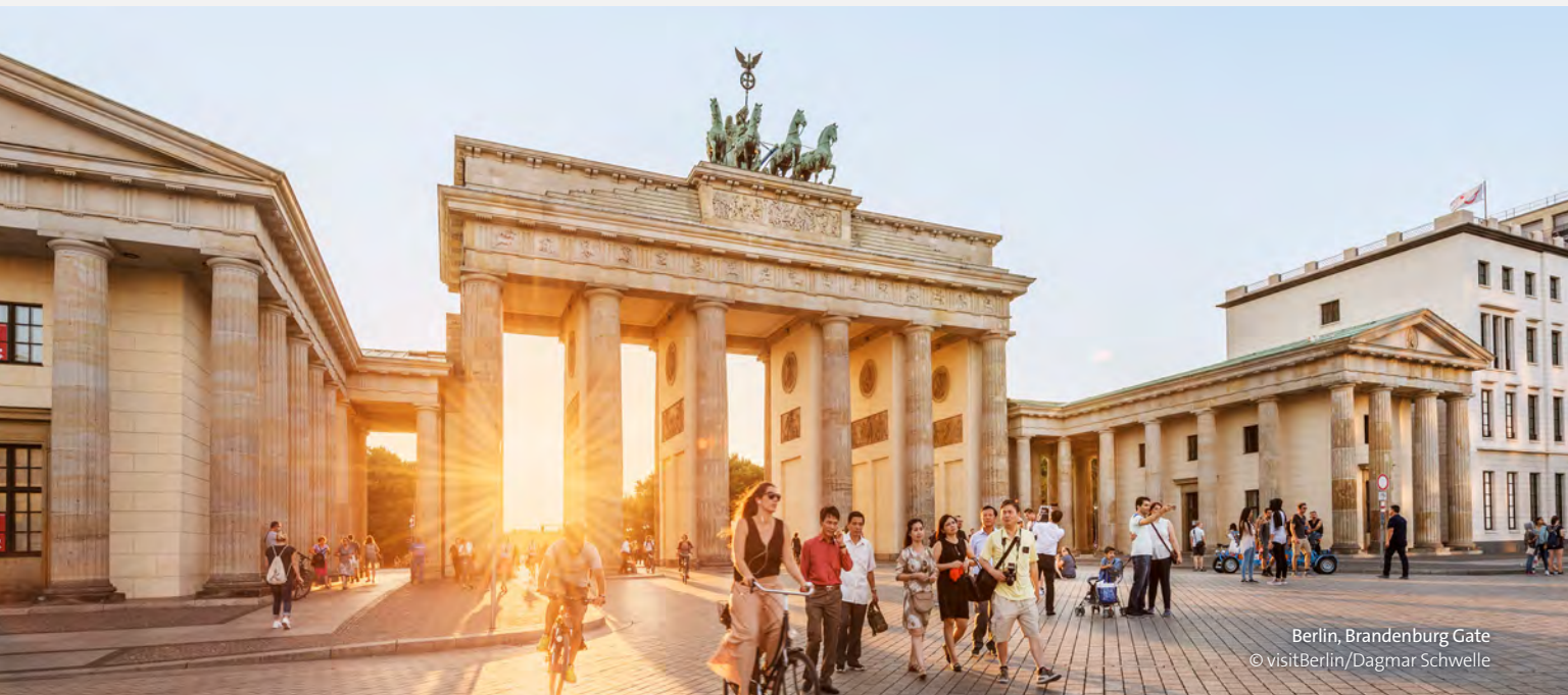
Berlin, Brandenburg Gate