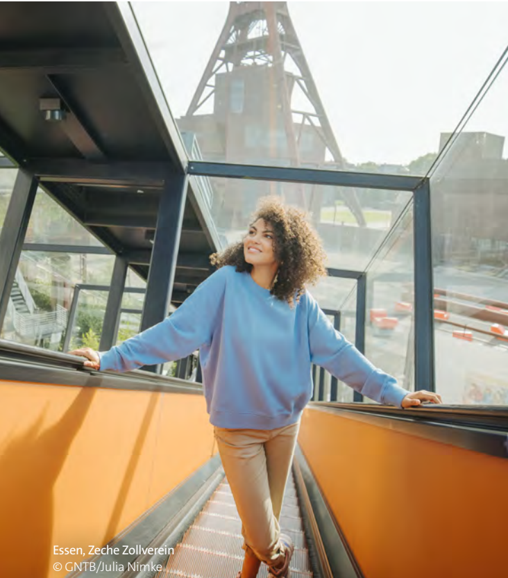
Essen, Zeche Zollverein

By way of the global German.Local.Culture. marketing campaign, the German National Tourist Office is putting a spotlight on authentic German traditions, customs, handicrafts and regional dishes. On the campaign's microsite, you can find travel information in four categories: Craft, Taste, Flair and Green.