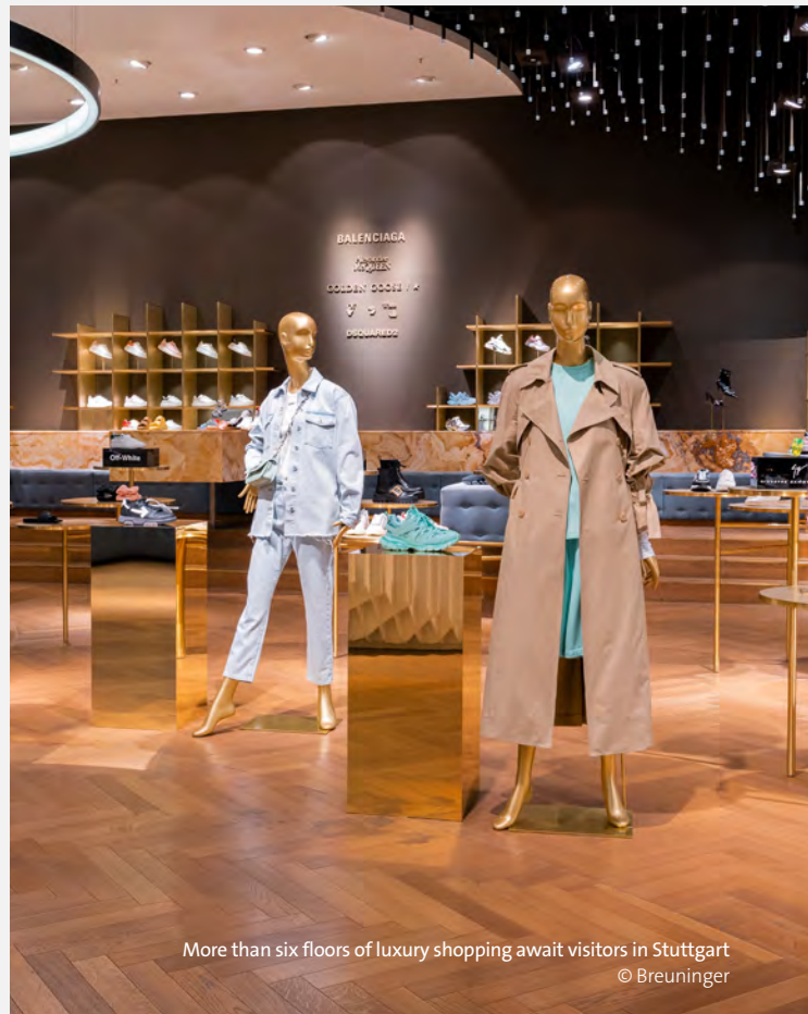
More than six floors of luxury shopping await visitors in Stuttgart

www.e-breuninger.de tourismus@breuninger.de