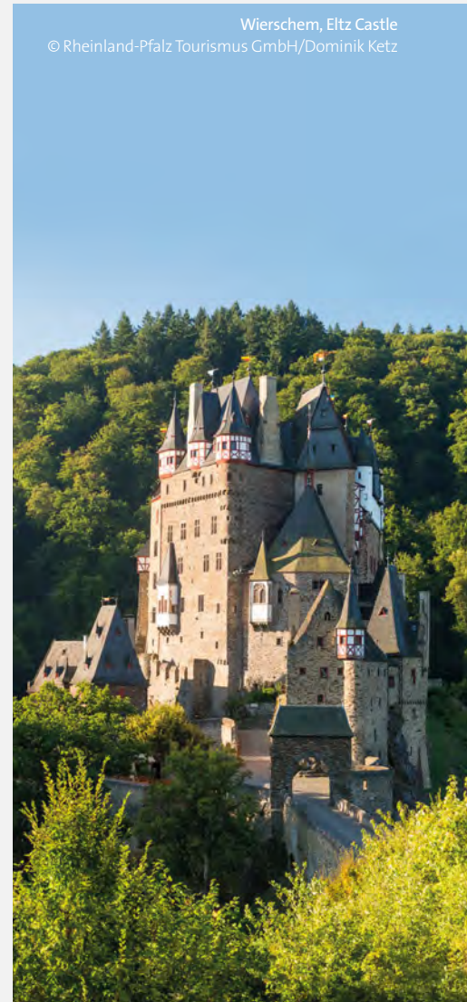
Wierschem, Eltz Castle

www.rlp-tourism.com info@rlp-tourism.com risch@rlp-tourismus.de