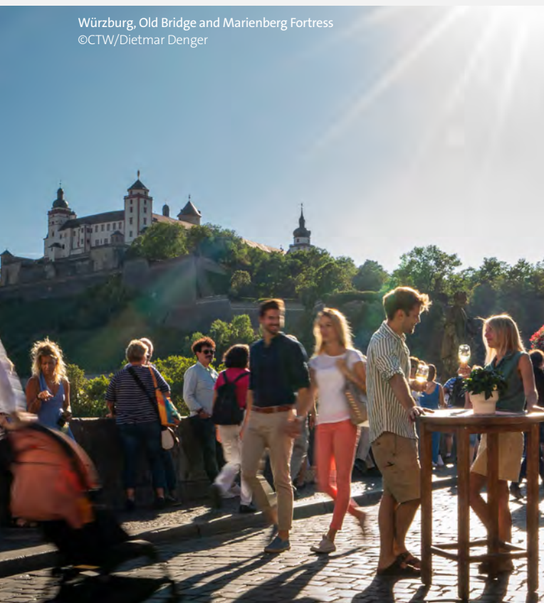
Würzburg, Old Bridge and Marienberg Fortress

www.wuerzburg.de/visitors www.wuerzburg.de/winepass service@wuerzburg.de