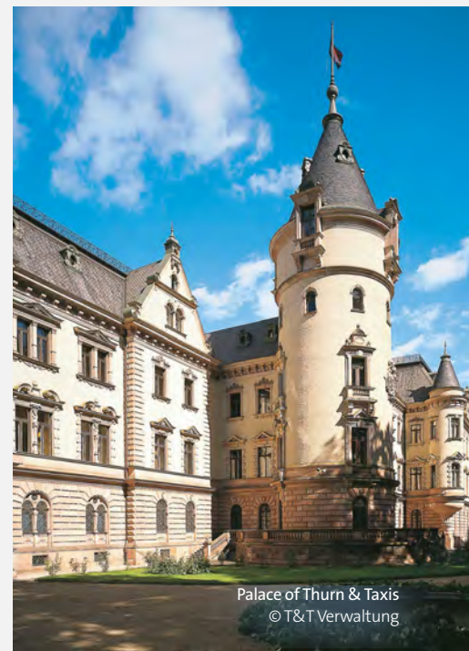
Palace of Thurn & Taxis

www.regensburg.us.com marketing@regensburg.de