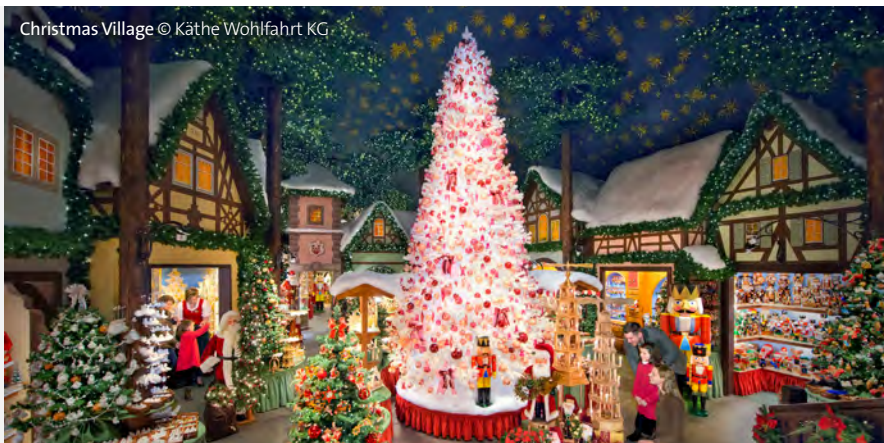
Christmas Village