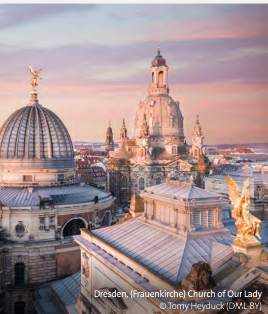
Dresden, (Frauenkirche) Church of Our Lady

By evening's end, the group returns to the Dresden suburb of Radebeul. Among the options, the state winery Schloss Wackerbarth invites visitors on a guided tour complete with a tasting. Hofjößnitz is the oldest winery in Saxony and the first producer of organic wines in the region. Food lovers can crown the evening with dinner in the starred Atelier Sanssouci restaurant, within an 18 th -century ballroom.