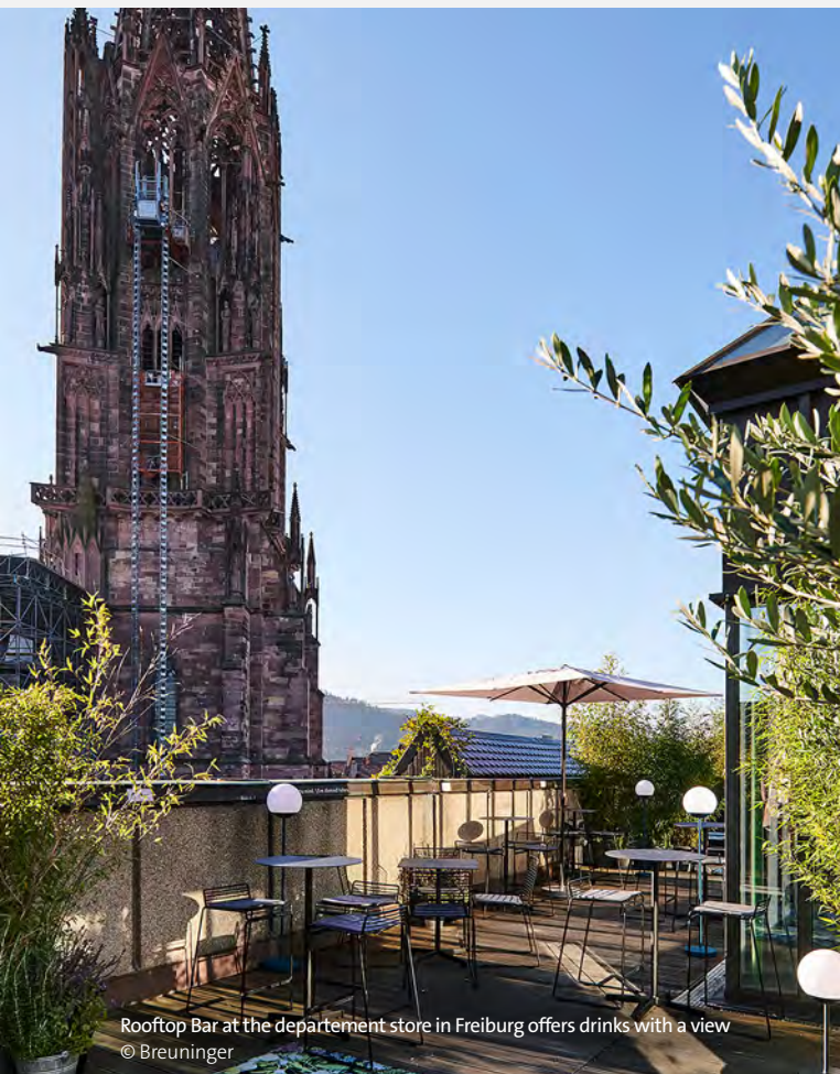
Rooftop Bar at the department store in Freiburg offers drinks with a view