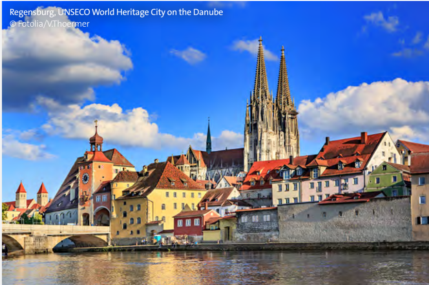
Regensburg, UNESCO World Heritage City on the Danube